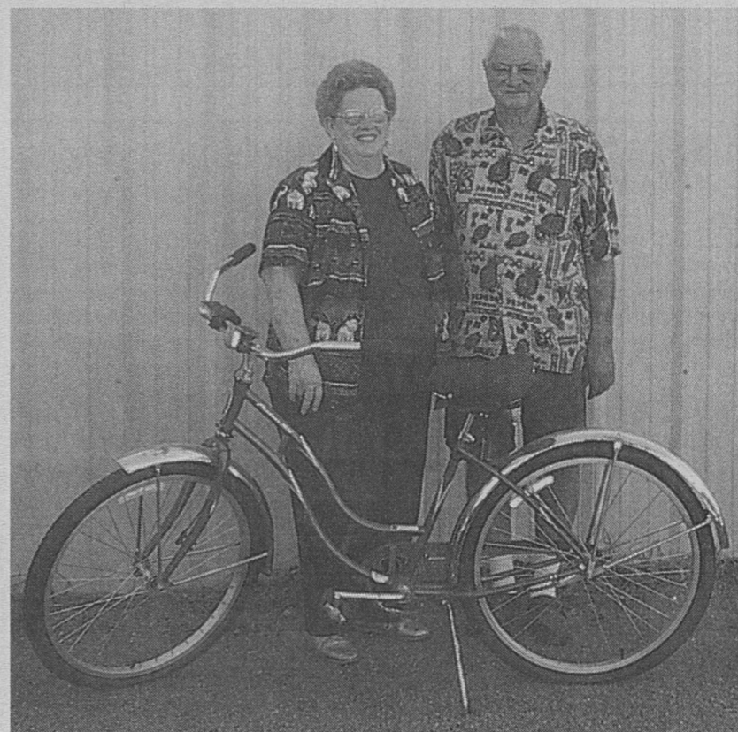
It's Auction time again!

Rice Hospital District, one of the special purpose districts, received (See Sales, Page 2)